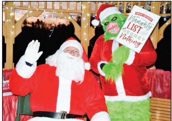
Santa Claus and the Grinch, who attended with PFLAG Blairsville, teamed up for some holiday fun at the Nottely Marina Christmas over the weekend.