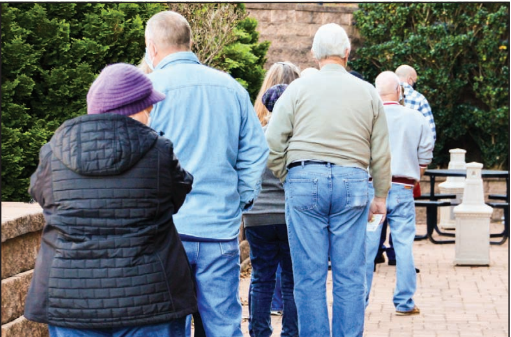
The first week of early in-person voting was busy for a runoff, which this year features a couple of incredibly high-stakes contests.